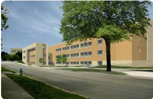
*UNT Chemistry Building